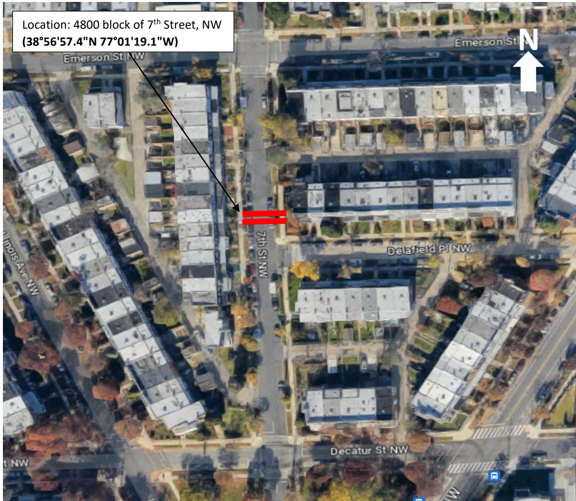
Figure 1: Data Collection Location

This report provides DDOT with vehicular volume, speed and classification data obtained from June 6 th and June 7 th , 2023, for the 4800 block of 7 th Street, NW. Figures 1 and 2 respectively, present the data collection location with respect to the surrounding roadway network with its coordinates, and a photograph of the data collection equipment.