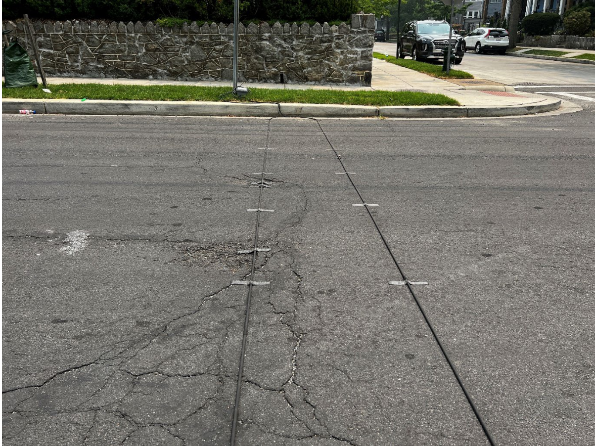
Figure 2: Photograph of Data Collection Equipment